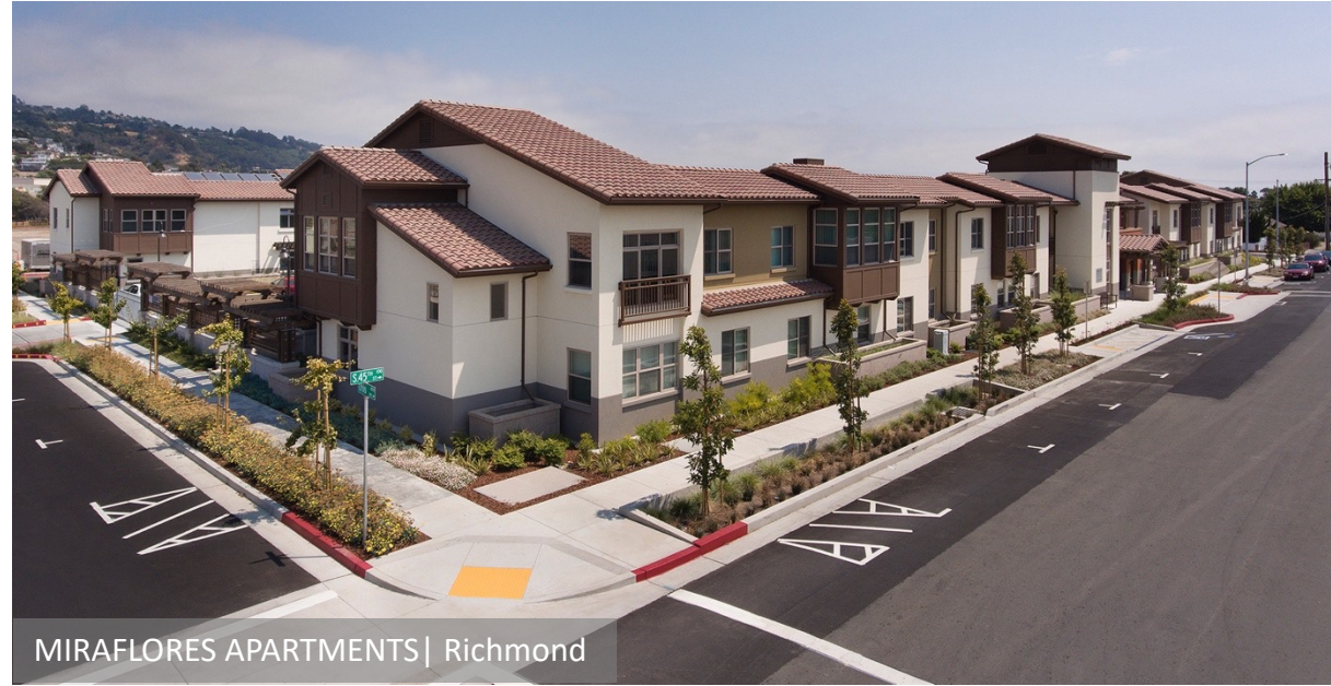
MIRAFLORES APARTMENTS | Richmond