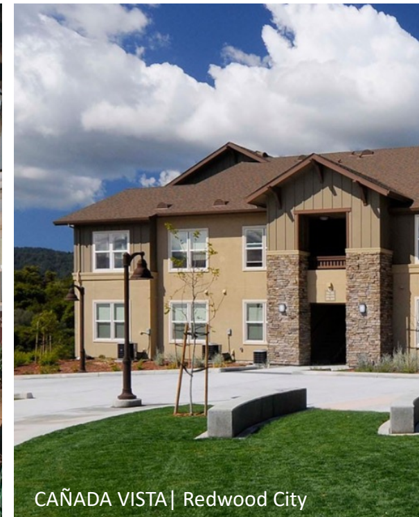
CAÑADA VISTA | Redwood City