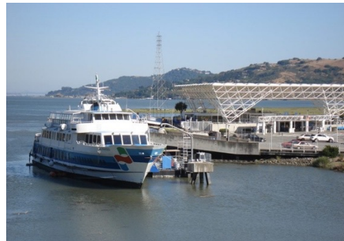
Larkspur Ferry Terminal