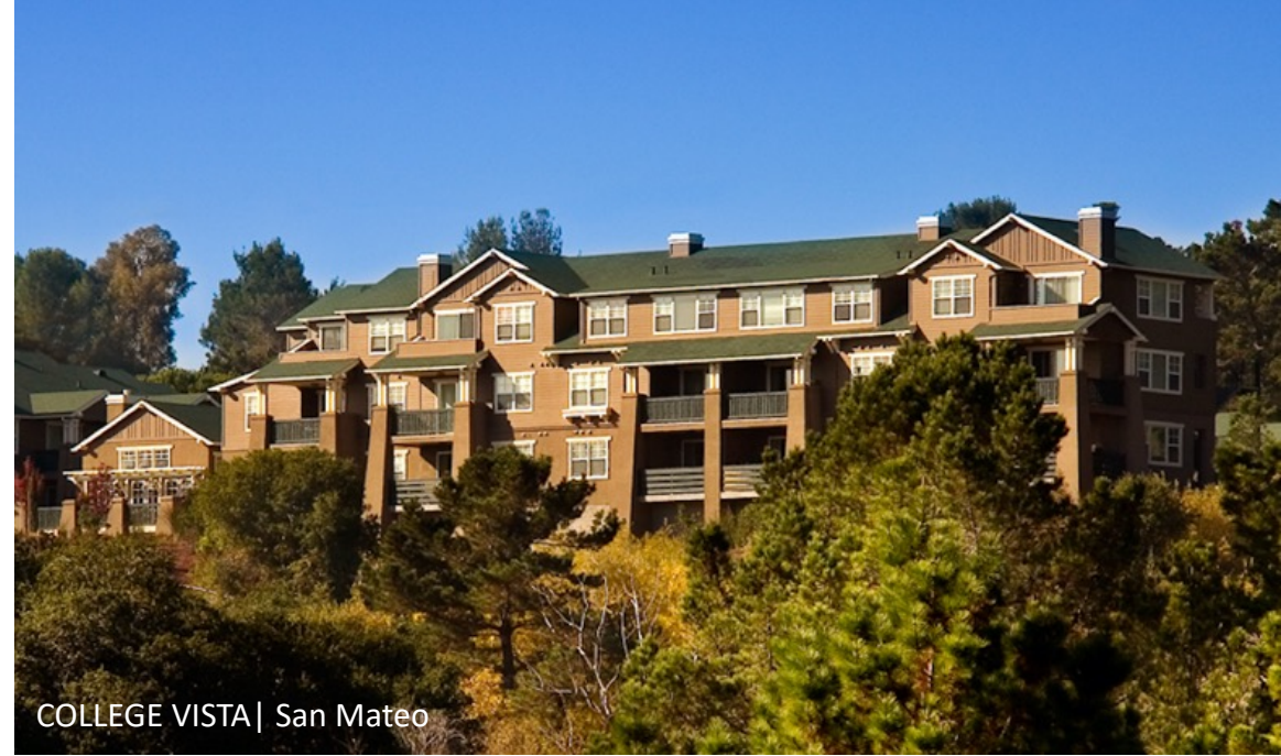
COLLEGE VISTA | San Mateo