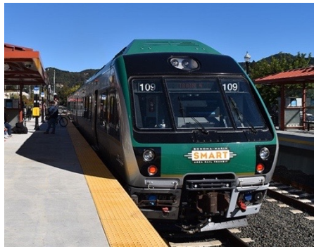
Larkspur SMART Train