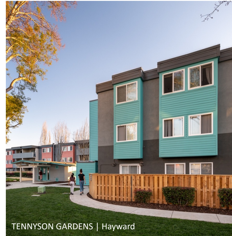
TENNYSON GARDENS | Hayward