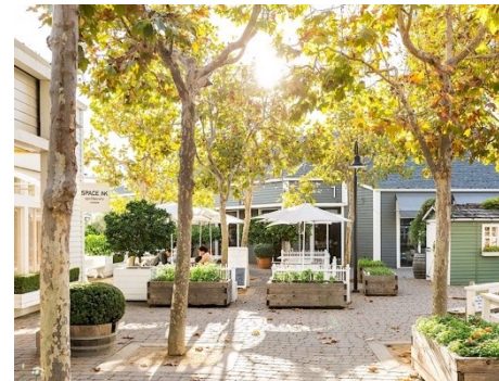
Marin Country Mart