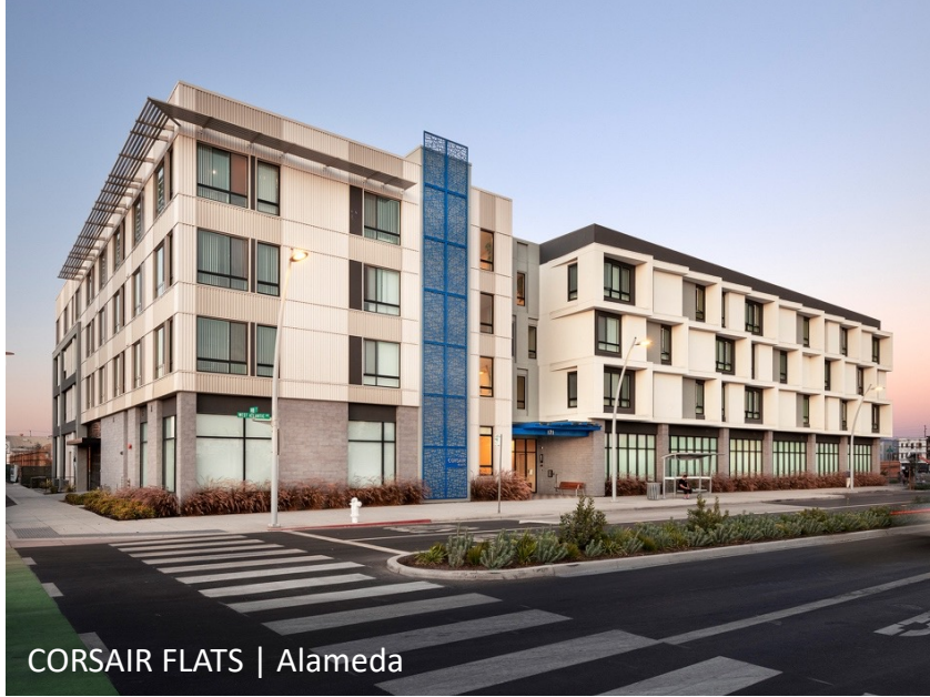
CORSAIR FLATS | Alameda