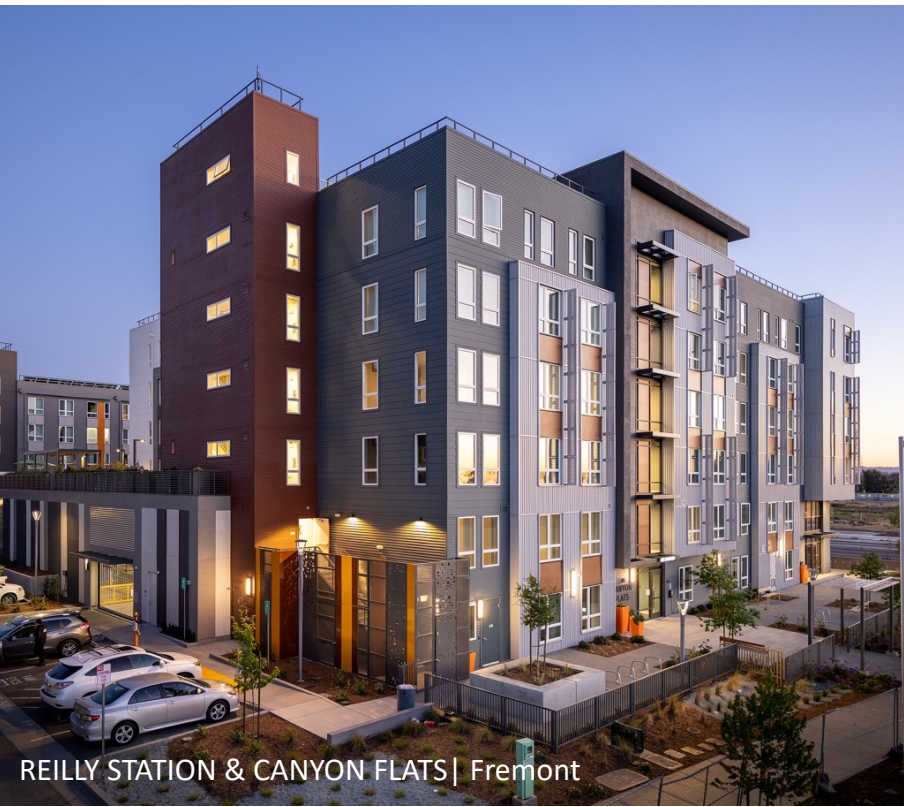
REILLY STATION & CANYON FLATS | Fremont