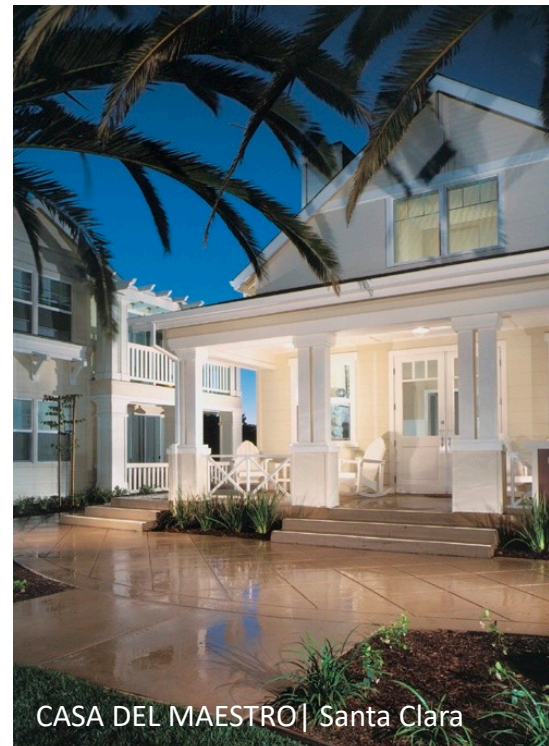
CASA DEL MAESTRO | Santa Clara